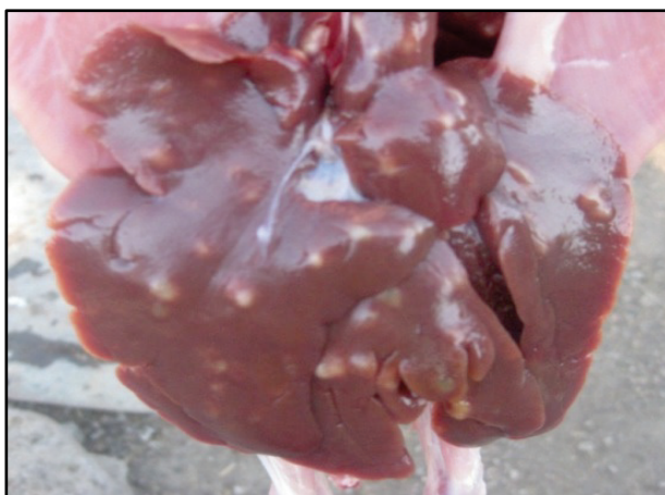
Fig. 2. Parasitic granulomas in rabbit liver with E. stiedae

The liver was enlarged, dark cherry colour, the capsule was moist, tense, unevenly hilly. The bile ducts were wide and well visible. In 120-day-old rabbits with a high level of E. stiedae , the gallbladder was enlarged 2–3 times due to excessive overflow of thick dark green bile (Fig. 3).