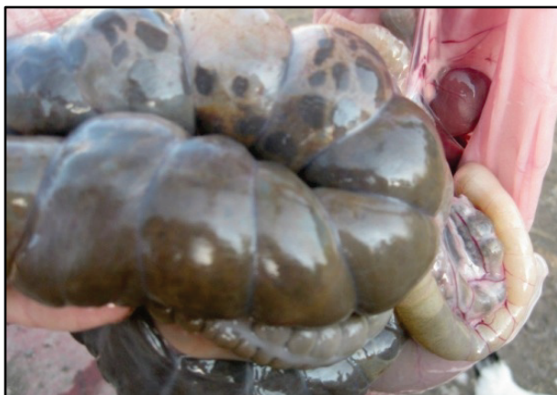
Fig. 1. Large bowel overflow of gases from E. magna

In the hepatic form of eimeriosis, small speckled hemorrhages were observed in some parts of the liver, and whitish nodules of various sizes were observed on the surface of the organ (Fig. 2).