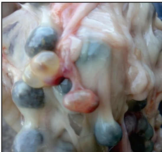
Fig. 7. Degenerated Taenia pisiformis on the mesentery

Adult rabbits also showed a 7.1-fold increase in the intensity of T. retortaeformis lesions, leading to intestinal enlargement and bloating (Fig. 8).