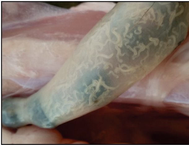
Fig. 5. Passalurus ambiguus in the cavity of the colon