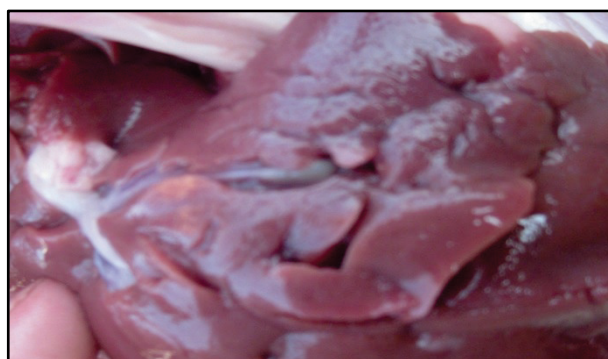
Fig. 4. Visual absence of the gallbladder in rabbits-parasitic carriers on low level of E. stiedae

Instead, in 320-day-old rabbits with a low level of E. stiedae , we registered a reduction in the gallbladder (“devastated” gallbladder). The bladder was reduced by 1.5–2.0 times in size and outwardly had the appearance of a “grey” strand (Fig. 4). A moderately narrow course, a slight thickening of its wall and a brownish-greenish content resembling mucus were recorded in the section of the organ. The folds of the mucous membrane were moderately thickened.