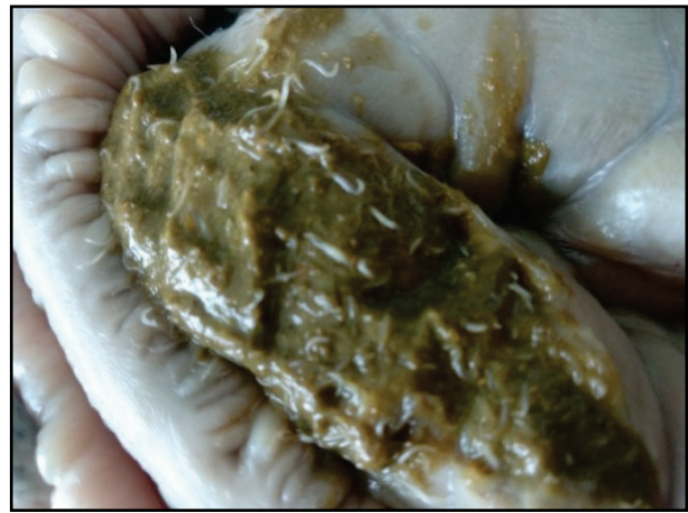
Fig. 8. Trichostrongylus retortaeformis in the chyme of the intestinal mass

living and source of nutrients. It completely depends on the host, negatively affects the host's condition, and can cause the host's death (Boyko et al., 2016). According to numerous studies, parasitoses contribute to development of somatic diseases, complications of chronic diseases, and affect the immune system. Characteristic of most helminths is the chronic course of the disease, related to the long term presence of the pathogen in the organism and possibility of repeating the infestation (Kirillova et al., 2020, 2021). At the same time, clinical features are manifested poorly, and pathological-anatomical changes are accompanied by productive processes which can practically change the functioning of part of the organ. A significant role in the pathogenesis of helminthoses is considered to be played by their mechanical impact conditioned by fixation of the parasites (using suckers, spikes, mouth capsules, cutting plates) and traumatization of the tissues or the host's organ, and is also related to the migration of larvae in the organism. During migration, nematode larvae synthesize enzymes which activate their penetration to their places of localisation. At the same time, helminth larvae provide opportunities for penetration of infectious agents (Thompson et al., 1994).