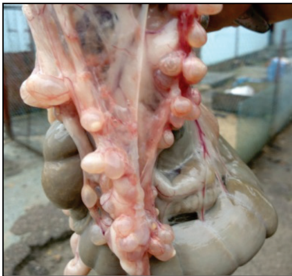
Fig. 6. Taenia pisiformis on the mesentery